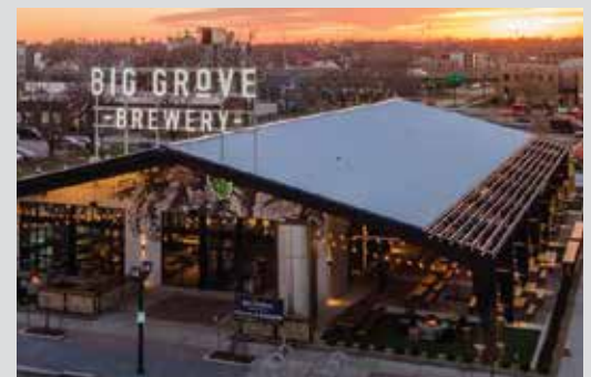
Photo: Sunset at Big Grove Brewery